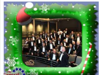
Temple Theatre Show promotion